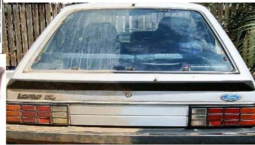
Some current users