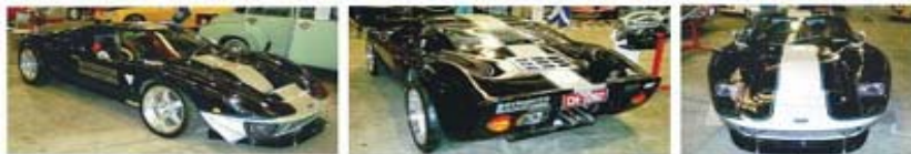
Guess what this 1.2 million dollar car is washed with