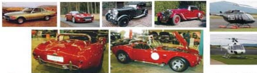
Guess what this 1.2 million dollar car is washed with